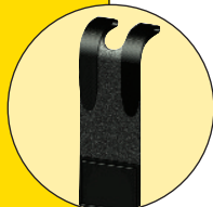
Armor 2600 Replacement Hand Strap $10.00

Enter or retrieve data while your PDA is in this tough case. Armor 2600's rugged reinforced ABS plastic protects your PDA from dirt, water, shock or impact. Waterproof and crushproof, Armor 2600 is perfect for military, industrial, emergency services, outdoor sports, airline, automotive, hunting or other harsh environments.