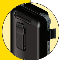
Armor 2600 Belt Clip $19.95